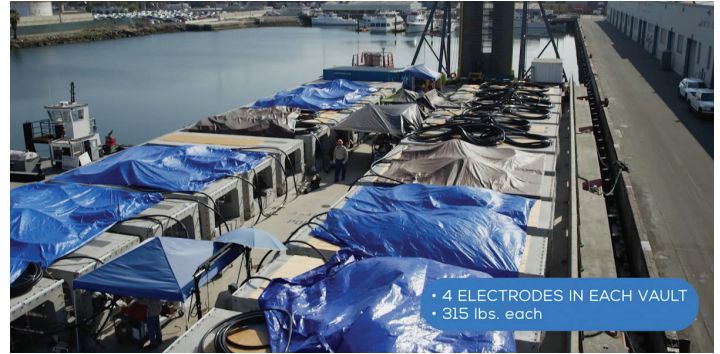
• 4 ELECTRODES IN EACH VAULT • 315 lbs. each