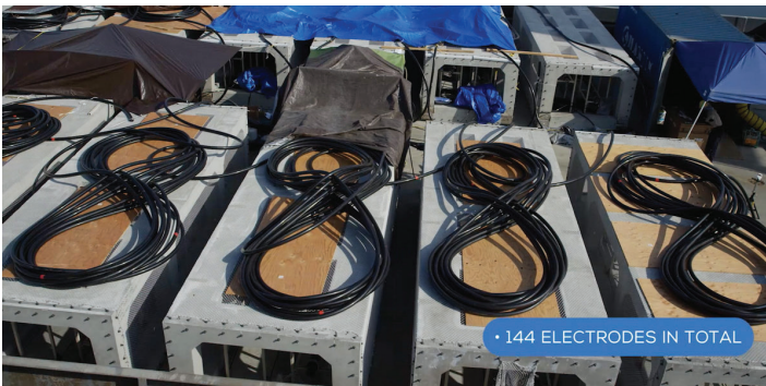
• 144 ELECTRODES IN TOTAL